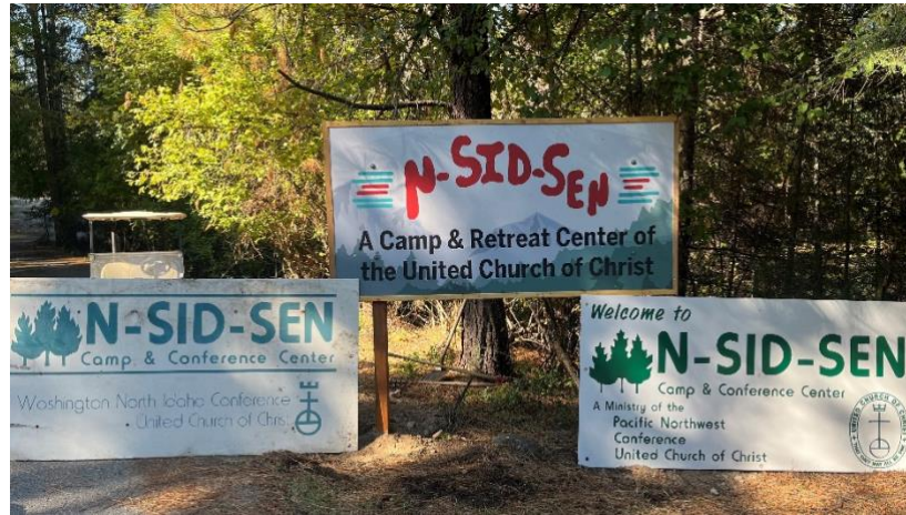
The steady flow of Change

The signs above each marked the north entrance to N-Sid-Sen. The oldest one on the left we found underneath the one on the right. If these signs could speak, imagine the changes they have seen. Through the transitions from WNI to PNC they have guided folks in. As new Managing Directors came and renewed programs or even started new ones the signs have reflected that change.